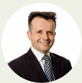
Vangelis Vitalis - Deputy Secretary Trade and Economic

Vangelis will provide valuable global context relating to NZ trade negotiations and what our current and future markets are prioritising.