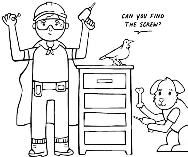
Make your home safer Te whakarite i tō whare kia haumaruru ake