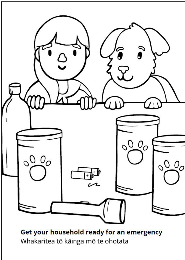
Get your household ready for an emergency Whakaritea tō kāinga mō te ohotata